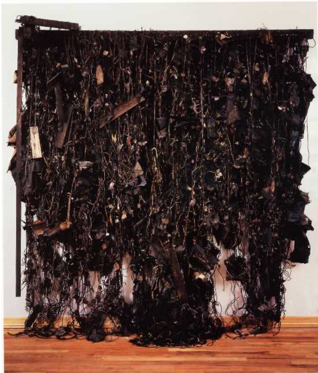
Fig. 1. Untitled (No. 8) , 1988, rope and mixed media, 120 x 108 x 20 in. (304.8 x 274.3 x 50.8 cm). Collection of the artist.